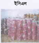
ইসিএল বৈদ্যুতিক তার