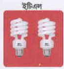
ইটিএল সিএফএল, এলইডি ও টিউব লাইট

The Commercial Attaché Embassy of Turkey Road No.2, House No.7 Baridhara 1212. Dhaka Bangladesh.