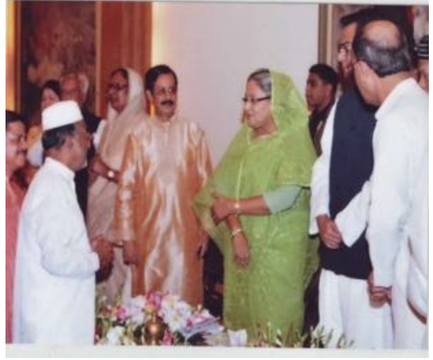
Pic: Exchanging pleasantries with the Hon. Prime Minister of Bangladesh, Sheikh Hasina