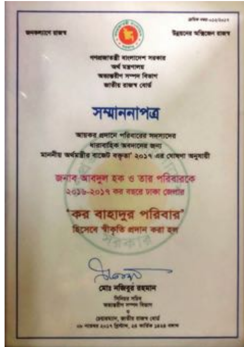
Pic: “কর বাহাদুর পরিবার” recognition from the Govt. of Bangladesh