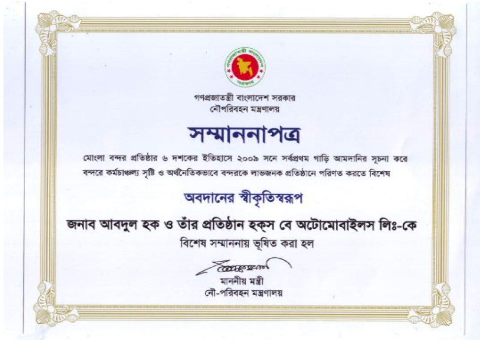
Pic: Recognition letter from the Hon. Shipping Minister of Bangladesh for exemplary role played in Reopening of Mongla Port