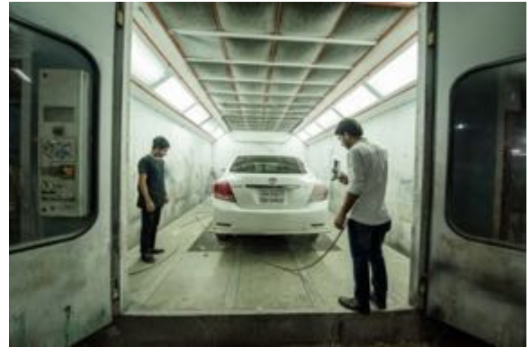
Paint work ongoing in fully equipped paint booth

No single automotive trader in Bangladesh has such comprehensive workshop and support engineering facilities at one place, which will cater all the technical needs of the customers. This facility is now being considered to be expanded and optimally used for other commercial/Industrial operations, like reconditioning of automotive vehicles, using the bonded house concept. Haq's Bay is also