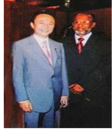
Pic: With former Hon. Prime Minister of Japan, Mr. Shinzō Abe (Left) and his successor, Hon Prime Minister of Japan, Mr. Tarō Asō, during their respective visits in Bangladesh as a leading dignitary representing Japan Bangladesh Chamber of Commerce and Industry (JBCCI).