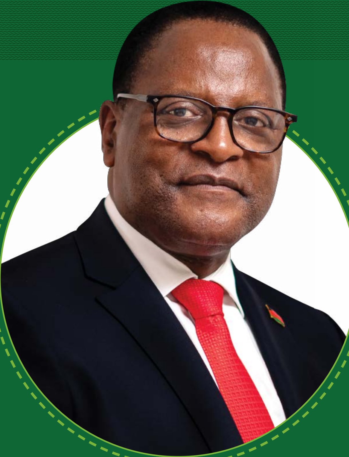
DR. LAZARUS MACCARTHY CHAKWERA PRESIDENT OF THE REPUBLIC OF MALAWI