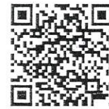
e-Certificate Verification System

Link: en.fda.moph.go.th/entrepreneurs-e-cer/category/sample